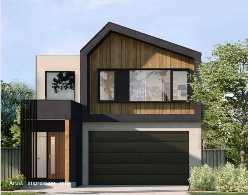
Artist impression only