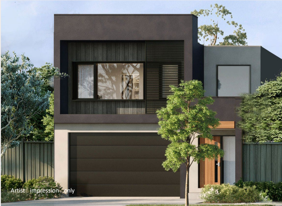
Artist impression only