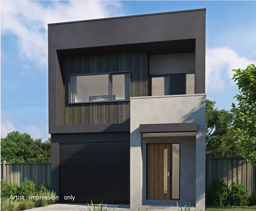
Artist impression only